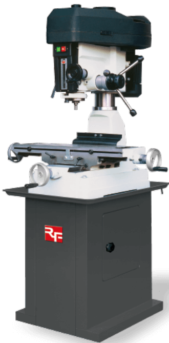
Round Column Mill/Drill