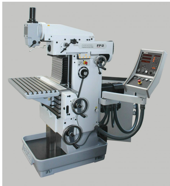
German made Deckel FP2 Knee Mill

A quill head was optional equipment on Deckel mills, and many found in the used market do not have a head with a quill (that raises and lowers the spindle like a drill press). The spindle is thus fixed in position requiring the knee to be moved upward for drilling or other Z-axis positioning, and this can be a distinct disadvantage in drilling, tapping and other similar operations. Most of these machines are equipped with a table that tilts and/or swivels for compound angle drilling/milling operations. FPS in Europe purchased the rights to Deckel designs and will make one to order and even help with shipment to the USA – but at a significant cost approaching $50,000. ( https://tinyurl.com/sffnmjk ) Oddly enough, Knuth (a German company) manufactures a Deckel-style mill in China which is available in the USA by special order.